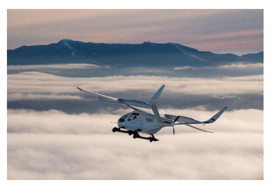
[ALIA-250 test flight in US]