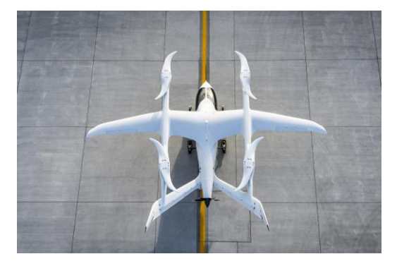
[under development eVTOL aircraft, ALIA-250]

BETA is currently developing the ALIA-250, its electric vertical take-off and landing aircraft. With a 50-foot wingspan and carbon-fiber fuselage, the aircraft uses a single distributed direct-electric propulsion system and has four horizontally mounted rotors that provide vertical lift and a single propeller in the rear for forward movement. The aircraft will be configured to carry 1,400 lbs of payload plus a pilot, or five passengers plus a pilot, and will have a maximum range of 250 nautical miles. BETA plans to use these aircraft for logistics, medical, and defense applications, and aims to expand into the passenger market quickly thereafter. Sojitz will leverage ALIA's unique performance characteristics specifically, maximum range and payload capacity - to realize new methods of air transport and distribution that meets the diverse needs of Japan's market. BETA has also developed multimodal charging infrastructure to enable its aircraft and other electric vehicles, which will support the deployment and scaling of this new advanced air mobility market.