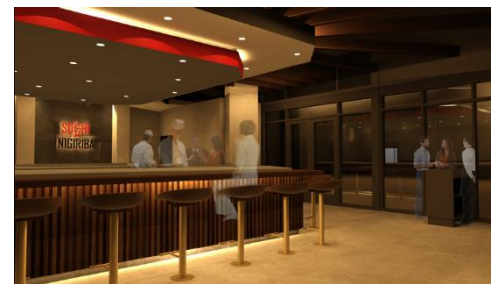
SUSHI NIGIRIBA (Culver City)

Against the backdrop of fast-growing overseas markets, business expansion into growth markets overseas has become increasingly important, particularly for the restaurant industry. Royal HD, Choushimaru, and Sojitz established SUSHI-TEN USA Inc. as a joint venture in March 2024 to develop business operations on the West Coast of the U.S. Each of the companies engaged in this joint venture has strengths in their respective fields. Royal HD has many years of experience and know-how operating Royal Host and other restaurant chains in Japan, Choushimaru has originality and expertise in sushi as a gourmet sushi chain in Japan, and Sojitz has global business networks and business development capabilities in Japan and abroad. Together, the companies aim to create new value in the U.S. that they could not achieve individually.