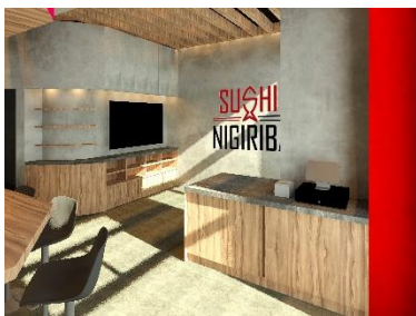
SUSHI NIGIRIBA (Huntington Beach)